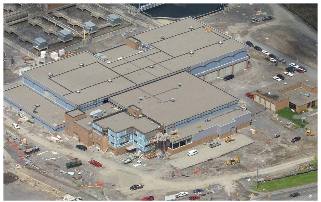
New Metro Complex at the 90% Completion Point