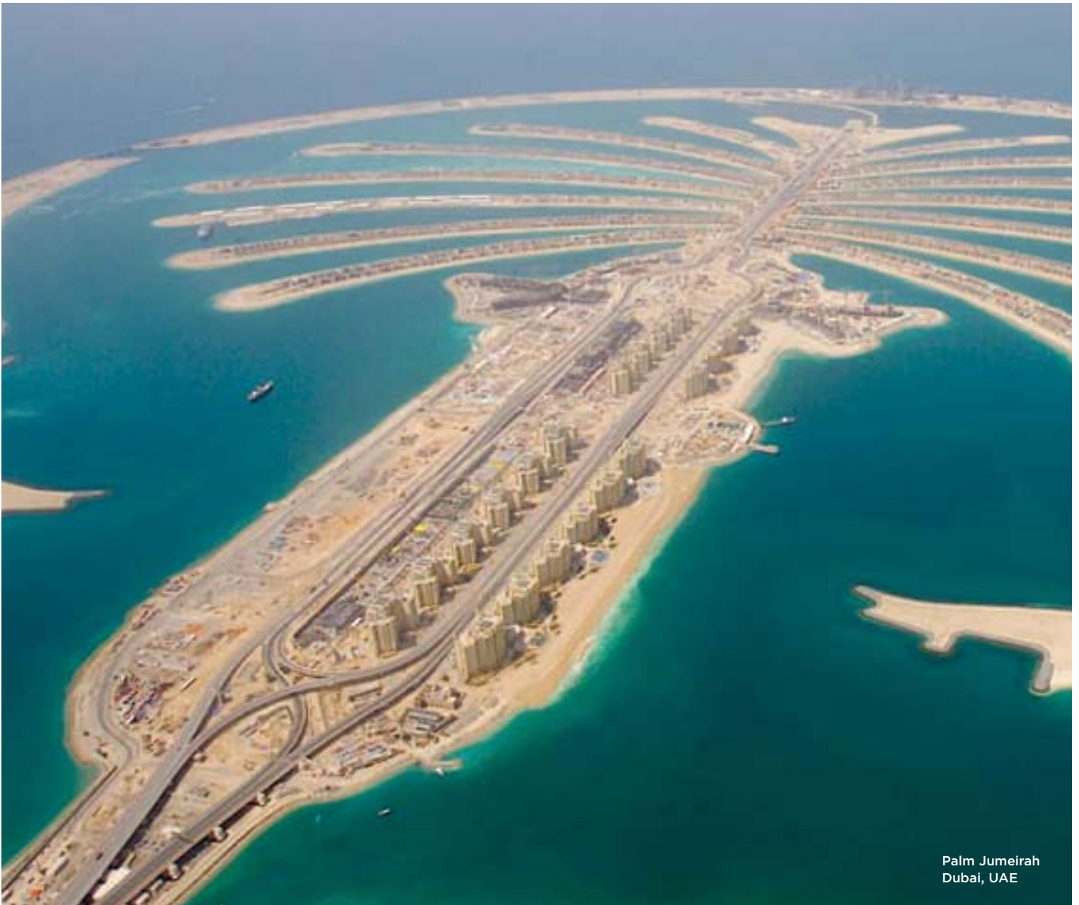
Palm Jumeirah Dubai, UAE